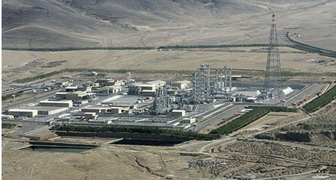
Figure 32: Arak Nuclear Facility

The nuclear facilities at Arak house two nuclear programs: an operational heavy water production plant and a 40 MW heavy water nuclear reactor facility, which is still in development and is not expected to come online until the third quarter of 2013, according to the IAEA. 125 The 40 MW Heavy Water Reactor at Arak has been compared to Israel's Dimona Nuclear Plant, and, according to the Institute for Science and International Security, will be capable of producing 9 kilograms of plutonium annually, or enough for two nuclear weapons each year when operational. 126 The United States and Israel allege that contrary to Iran's claim that the Heavy Water Research Reactor is operated for peaceful purposes, Iran really intends to develop an alternate methodology for the manufacturing of nuclear weapons using Plutonium-239 instead of an enriched Uranium-235 based device.