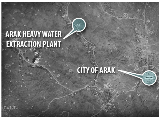
Figure 34: Arak Heavy Water Plant Distance to City of Arak : 50 km (31 miles)

According to reliable sources, there is a heightened awareness of defense and security concerns arising from a potential strike against the Arak facility. The town of Khandab was approved for coordinating civil defense by the Political and Defense Commission of Government in 2009. 129 At the town level, the mayor of Khandab is the head of the Crisis Management Task Force. Security issues are addressed by the Security Committee, which consists of members from the intelligence agencies, police, the Revolutionary Guard and the heads of some civil organizations. The town suffers from a lack of funds and has a limited capacity in terms of responding to emergencies. Despite frequent Sky Guard drills, the facility cannot be shielded against a U.S. or Israeli military strike. 130 The total number of hospital beds in Arak is reported to be 1,033. 131