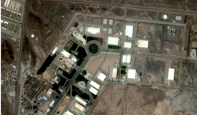
Figure 28: Aerial View of the Natanz Facility

As the site of Iran’s underground Uranium Enrichment Facility, the Natanz facility (Figure 28) sits at the heart of Iran’s nuclear program. With a capacity eventually to house more than 50,000 centrifuges, it is feared that the Natanz facilities will soon produce enough highly enriched uranium (HEU) for Iran to make dozens of nuclear weapons. Natanz houses a Fuel Enrichment Plant (FEP) for the production of low enriched uranium (LEU) up to 5%, as well as a Pilot Fuel Enrichment Plant (PFEP), which has produced 110 kg of 20% enriched U-235 since February 2010. 113 The Iranian government claims it intends to use the 20% U-235 UF6 to manufacture fuel for the Tehran research reactor; however, others believe that some of this material could be used to produce fuel for reactors that may be further processed for the production of weapons grade plutonium. Thus, much of the fear about Iran’s nuclear program is focused on the operation and efficiency of the centrifuges buried in this plant. The concern is that the material is a strategic stockpile for weapons.