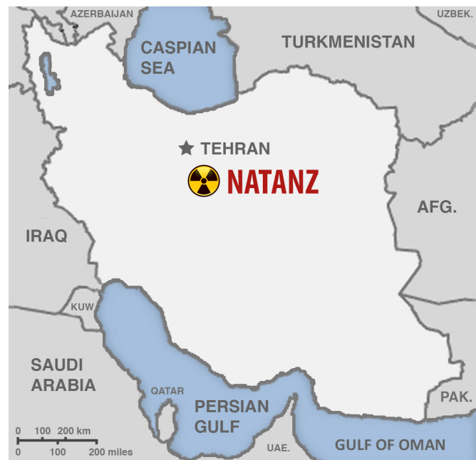
Figure 29: Natanz, Iran