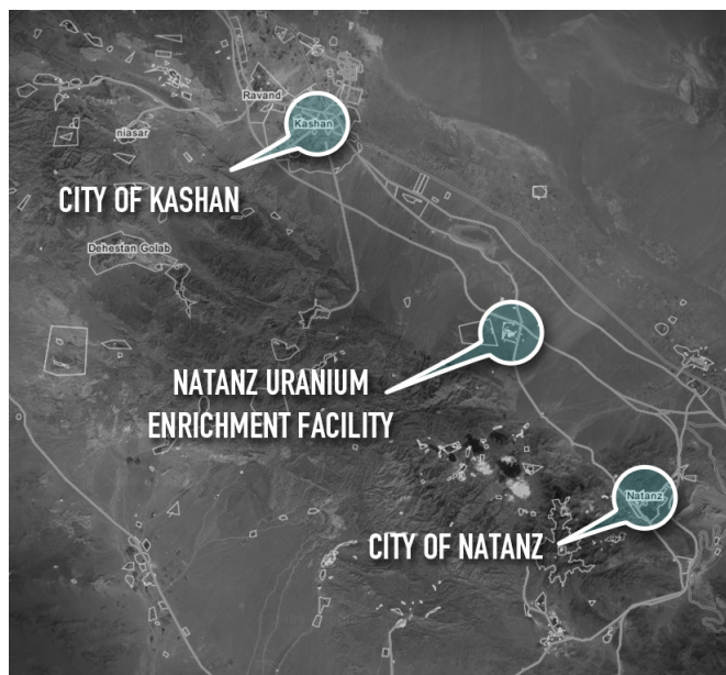
Figure 30: Distance: Natanz 28 km, (17.4 miles) Kashan 35 km (21.7 miles)